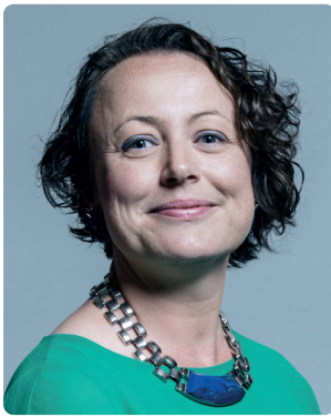
Catherine McKinnell MP Minister for School Standards

I 'm delighted to have this opportunity to greet all of you at the School Business Professionals Summit 2025! As Minister of State for School Standards I am determined that every child and young person has every opportunity to succeed, no matter who they are or where they come from.